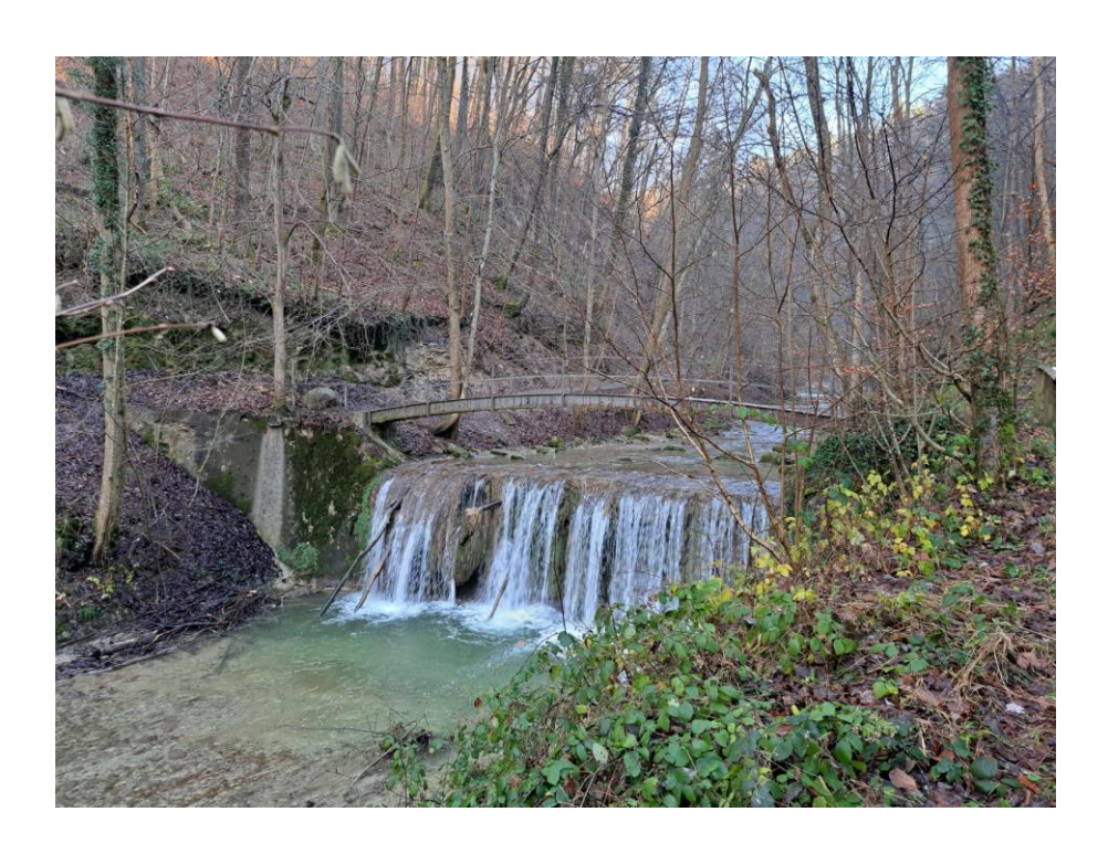
April 30 19.00 h

To register, contact Barbara by SMS on mobile 079 582 19 48 (answering machine is out of order) or by e-mail to merk.barbara@gmail.com